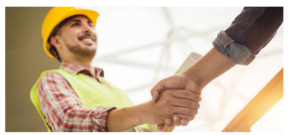
Step 3: Get a surety bond quote.

The easiest way to find a surety provider is to search online for one that issues bonds nation-wide. This way you'll know that they can bond you no matter what state(s) you plan to work in. When you contact a surety provider, you'll have to answer basic questions about your professional work experience and personal financial history. Depending on the type of bond you need, you might have to provide your social security number so the surety can review your credit score. If your business has more than one owner, the financial credentials of all owners will be considered.